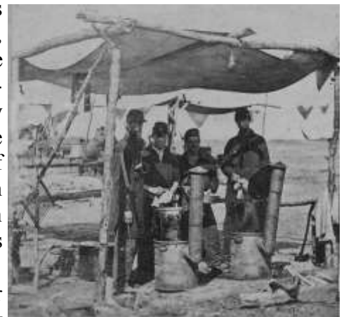
Soldiers cooking, Civil War.

In the Civil War there were thousands of troops on campaign for months and even years, and some nutritional problems arose. Scurvy developed over winters, and during the Atlanta Campaign around 20% of Sherman’s troops showed symptoms until fruits and berries were ripe. Elsewhere, there were occasional skirmishes for berry patches, the