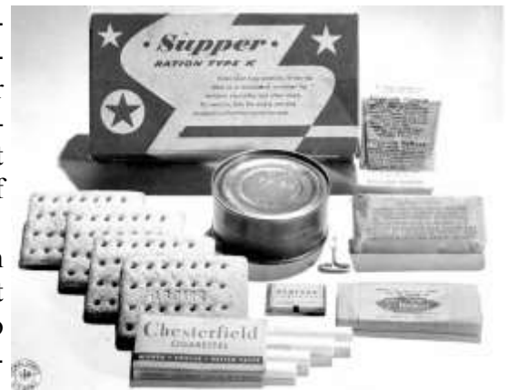
A K-ration supper menu.

The Surgeon General reestablished a Food and Nutrition unit on 26 August 1940 and received the authority to set Army diet and nutrition standards. Army and Navy Surgeons General also pushed the Office of Scientific Research and Development to organize civilian nutritionists in 1940. Research was largely done by conscientious objectors (who volunteered as test subjects) and looked at climatic variations on metabolism and eating, and also vitamin super-abundance. Studies also found no great loss of vitamins in sweat, that there was no need for salt tablets if meals were eaten (even at 10 liters sweating per day), and that a high-protein diet helped in cold environments. Scientists also tried to find ways to make food more attractive (e.g. keeping dried eggs from browning) that would increase consumption and reduce waste and shipping space. In 1944 a Medical Nutrition Laboratory was created directly under The Surgeon General, with approximately twenty-four personnel, replacing the four personnel crowded into the Army Medical School.