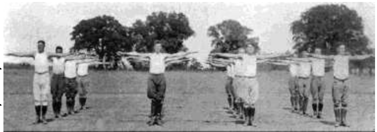
WWI Army PT formation.

During the two decades between WWI and WWII physical readiness training slowly reverted back to its roots with the publication of three doctrinal manuals: Training Regulation 115-5 (1928); Basic Field Manual (1936); and FM 21-20 (1941). All three manuals were published under the guidance of the Superintendent, United States Military Academy. Although Koehler's training doctrine worked well at West Point, where there was sufficient time to prepare cadets physically, preparing recruits for combat in 12 weeks was an entirely different matter. In virtually every combat after action review, leaders expressed concerns over how poorly citizen-soldiers were prepared for the physical rigors of combat. "Of the first two million men examined under Selective Service, fully half were found unfit for military combat service." "Had we had proper physical fitness programs in America for the 23 years prior to Pearl Harbor, many of our boys that made the supreme sacrifice would be alive today."