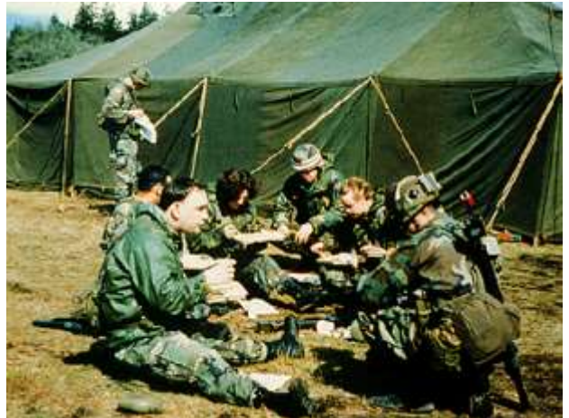
Soldiers eating MREs, 1980s.

As an example, the Army wants a cognitive stamina extender for tired soldiers, especially those performing repetitious duty – guards, drivers, etc. Amphetamines have been ruled out; amino acids as precursor chemicals are a possibility; serotonin is an option; Modfinil (a narcolepsy drug) is an option. But the best option, balancing all factors, is caffeine, and it has been in the ration since 1832. Overall, recent research has shown that it is not possible to boost troops above 100% of normal physical performance through food supplements but a better possibility is reducing the performance degradation of stress and fatigue.