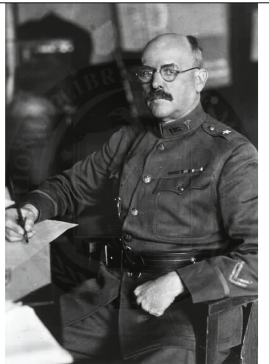
Brig. Gen. Kean in 1918 http://www.ihm.nlm.nih.gov/ihm/images/B/16/151.jpg

Sanders Marble Historian, Office of Medical History, U.S. Army