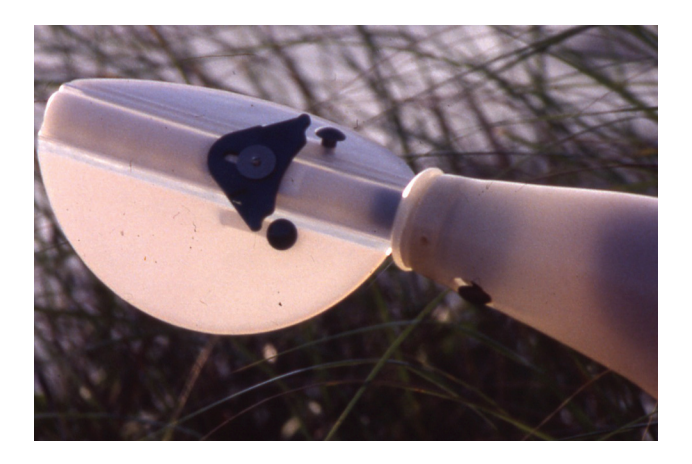
Figure 24-23. Freestyle swimming prosthesis. Photograph: Courtesy of TRS Inc, Boulder, Colo.

Figure 24-22. Soccer ball handling device. Photograph: Courtesy of TRS Inc, Boulder, Colo.