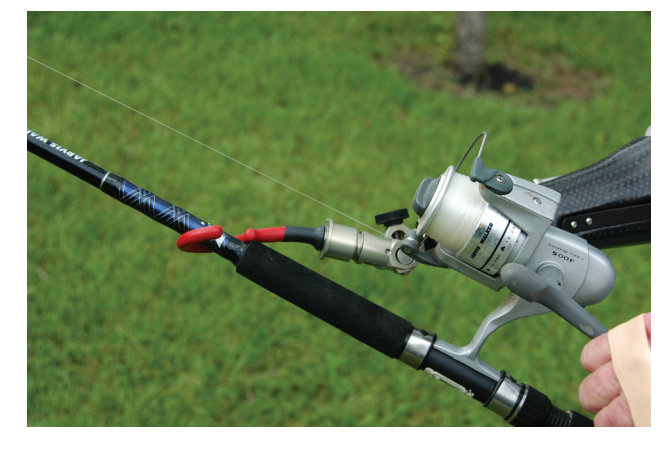
Figure 24-31. Universal Handle Holder (fishing rod application; Texas Assistive Devices LLC, Brazoria, Tex).

Figure 24-32. Rubber slip-on reel handle grip accessories.