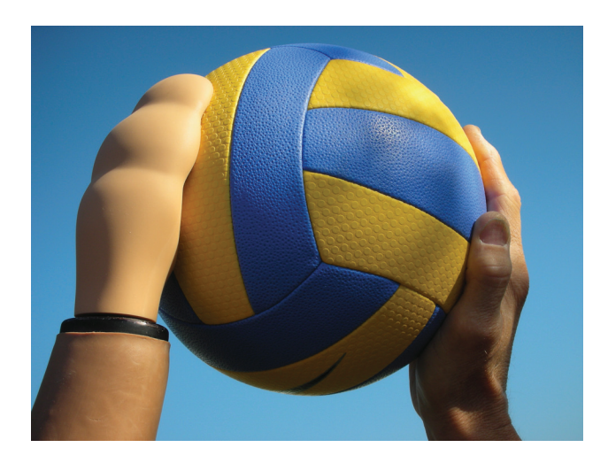
Figure 24-21. Volleyball handling device.