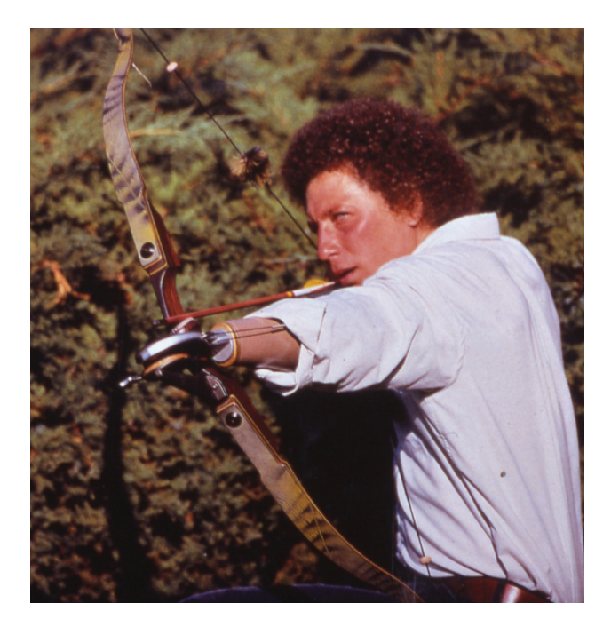
Figure 24-2 . Correct prosthetic alignment, allowing for accurate arrow draw and release. Photograph: Courtesy of TRS Inc, Boulder, Colo.

Photograph: Courtesy of TRS Inc, Boulder, Colo.