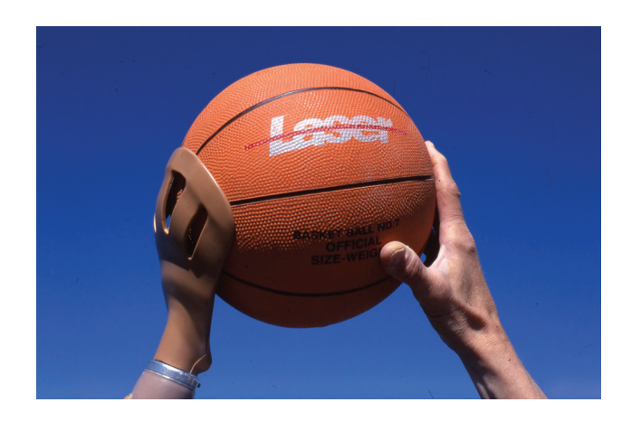
Figure 24-20. Basketball accessory.