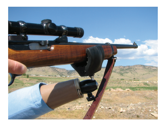
Figure 24-41. Gun turret used with a carbine. Photograph: Courtesy of TRS Inc, Boulder, Colo.

Figure 24-40. Gun turret used with an M-16. Photograph: Courtesy of TRS Inc, Boulder, Colo.