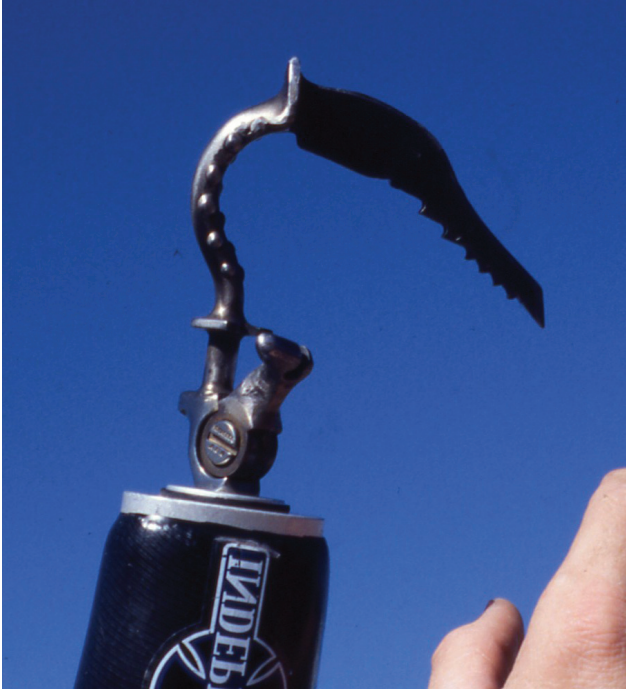
Figure 24-47. Prehensor used for technical climbing. Photograph: Courtesy of TRS Inc, Boulder, Colo.

Figure 24-48. Modified split hook for climbing by Pete Davis, accomplished amputee climber. Photograph: Courtesy of TRS Inc, Boulder, Colo.