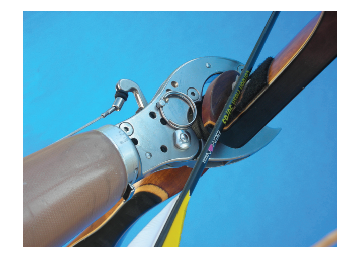
Figure 24-3. TRS GRIP 2S Prehensor with locking pin holding recurve bow and arrow. Photograph: Courtesy of TRS Inc, Boulder, Colo.

Figure 24-2 . Correct prosthetic alignment, allowing for accurate arrow draw and release. Photograph: Courtesy of TRS Inc, Boulder, Colo.