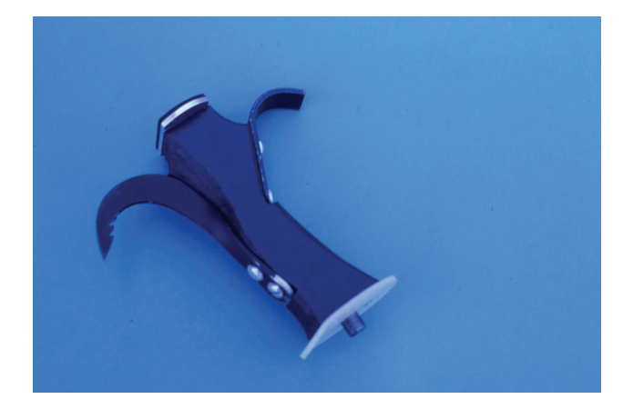
Figure 24-50. Technical climbing prosthesis custom built for Aron Ralston. Photograph: Courtesy of TRS Inc, Boulder, Colo.

Figure 24-49. Mountaineering device custom built for Aron Ralston, who gained notoriety after amputating his lower arm that had become trapped by a boulder while he was climbing in Blue John Canyon, Utah. Photograph: Courtesy of TRS Inc, Boulder, Colo.