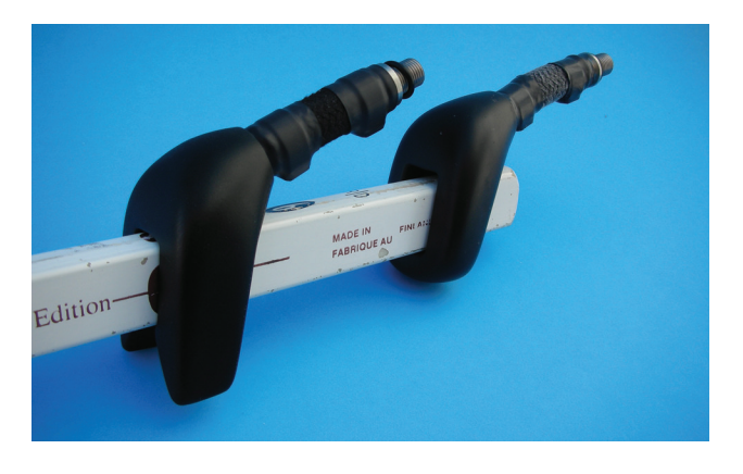
Figure 24-46. Nordic and alpine ski prostheses. Photograph: Courtesy of TRS Inc, Boulder, Colo.

Figure 24-45. Ski accessory (extended for pole plant). Photograph: Courtesy of TRS Inc, Boulder, Colo.