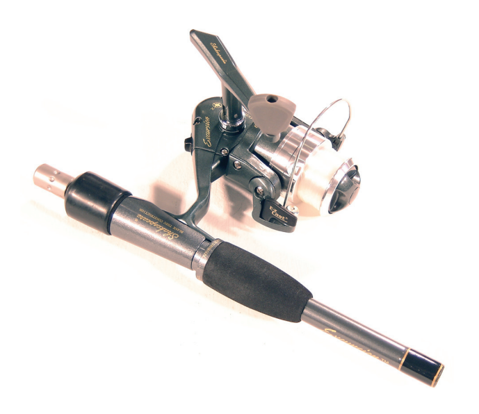
Figure 24-30. Fishing rod prosthetic adaptor.

Figure 24-29. Prehensor with spinning reel.