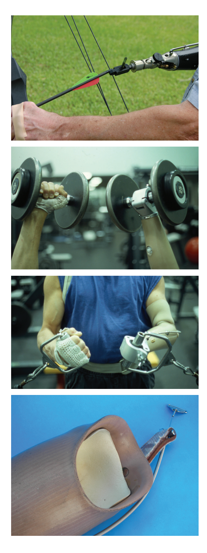
Figure 24-4. Quick Release Gripper archery trigger with N-Abler (Texas Assistive Devices LLC, Brazoria, Tex).