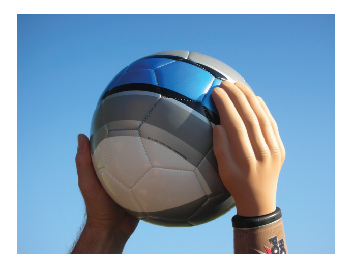
Figure 24-22. Soccer ball handling device. Photograph: Courtesy of TRS Inc, Boulder, Colo.

Figure 24-21. Volleyball handling device. Photograph: Courtesy of TRS Inc, Boulder, Colo.