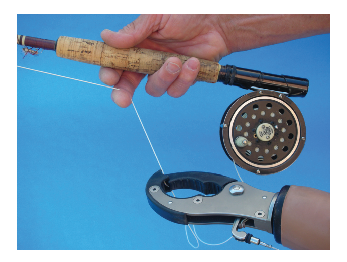
Figure 24-34. Prehensor with fly fishing rod, reel, and line.