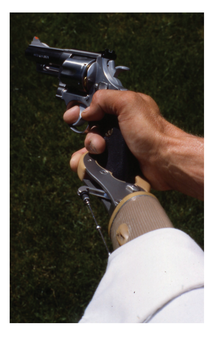
Figure 24-35. Prehensor with 44-magnum pistol.