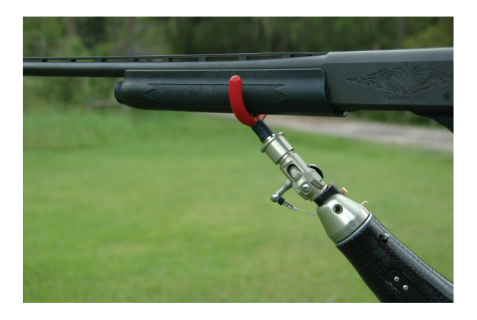
Figure 24-42. Tool/gun cradle adaptor.

Figure 24-41. Gun turret used with a carbine.