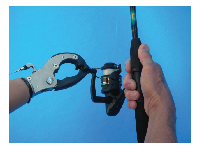
Figure 24-29. Prehensor with spinning reel.