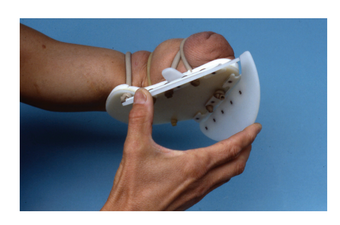
Figure 24-27. Dual bike brake lever. Photograph: Courtesy of TRS Inc, Boulder, Colo.

Figure 24-26. Prehensor used with stick shift. Photograph: Courtesy of TRS Inc, Boulder, Colo.