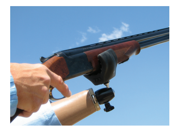
Figure 24-39. Gun turret prosthesis with over-and-under shotgun.