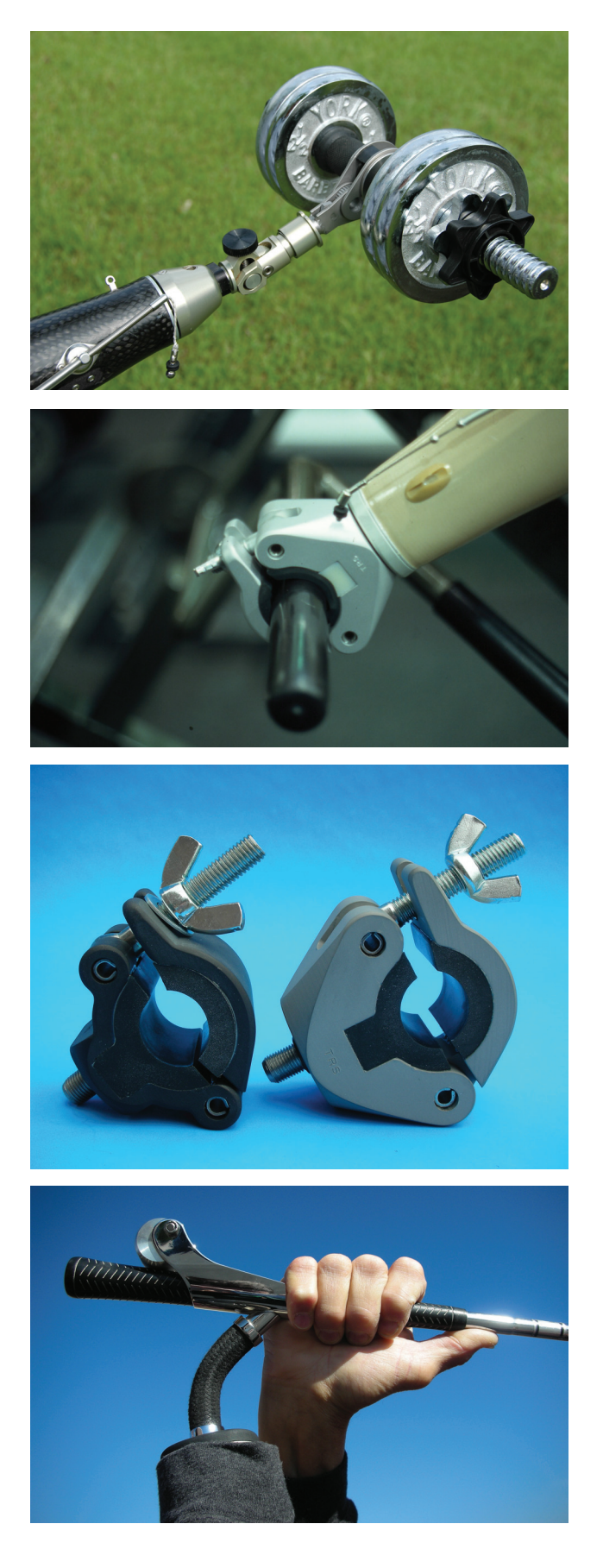
Figure 24-10. Weight-lifting device.

Figure 24-11. Heavy-duty weight-lifting device.