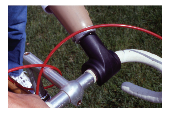
Figure 24-28. Bicycle accessory.