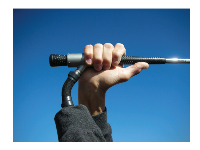
Figure 24-14. Golf prosthesis, left model.