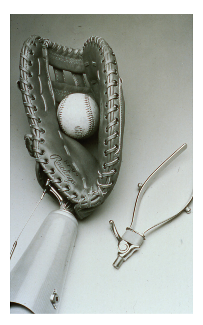
Figure 24-17. Baseball glove adapter split hook.