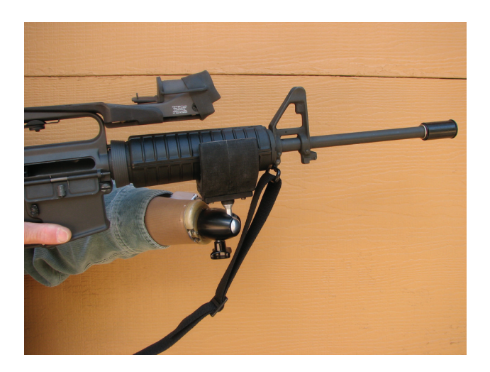
Figure 24-40. Gun turret used with an M-16.