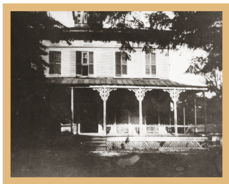
The Lay House; Once a Mansion of Historic Proportions

Creek Road to the village of Brightwood. Equipped with the discarded horses and bobtail cars of the metropolitan line of the B & O, the impatient patrons dubbed their public transportation system the GOP, "get-out-and-push", because of its frequent foundering en route. Takoma Park and North Takoma were disarticulated rural dependencies. The Brightwood postal service, one a "will-call" station in the crossroads store at Piney Branch Road and the turnpike, location of the tollgate, sported a letter carrier, complete with horse and sulky. The adolescent breast-