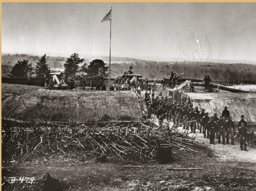
Breastworks and Sallyport; Ft. Stevens, Washington, D.C.; 1864