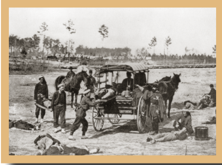
Civil War Ambulance

As one of his first official acts, the new Surgeon General replaced Dr. Tripler with Dr. Jonathan Letterman, thus providing McClellan, his patron, with an energetic young physician who recognized the factual needs of field medical organization. 26