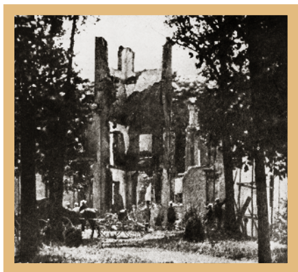
Blair House, Silver Spring, Md.; Destroyed by Confederates, 1864

As he said, "the hospital system had scarcely received any attention up until this time", and at one period "hospitals for over twenty thousand sick and wounded were established in Washington alone", 33 where during the war a total of forty-three hospitals were operative, with seven additional