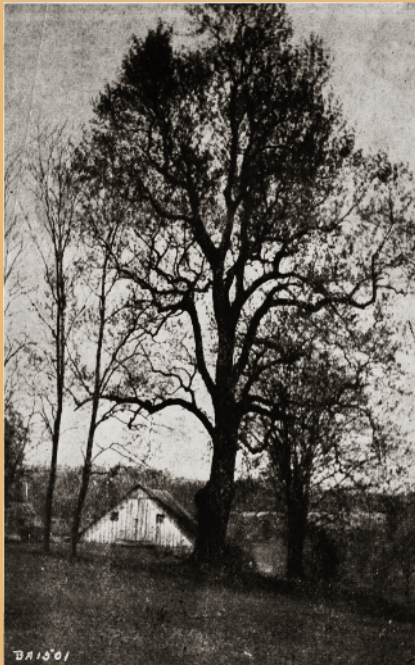
Sharpshooters Tree used by Confederates; Battle of Ft. Stevens

Carberry House, or the Lay Mansion, as it was more generally known, was rebuilt after the war and continued to be known as Norway until the early part of the twentieth century. It