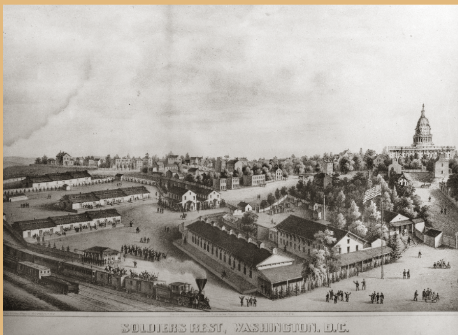
The Wounded come to Washington

the abilities of the wearers. General hospitals of sorts had been used in other American wars, 15 primarily as a place to accumulate the non-transportable wounded than as an effort to classify the sick, but no Army general hospital existed at the outbreak of the Civil War. 16 On August 3, 1861, the Congress authorized an increase in the number of medical officers and provided for the employment of medical cadets and female nurses. 17 The former were mainly students recruited to serve as dressers and assistants to the surgeons, and female nurses, in spite of Dr. Blackwell's foresight, were untrained.