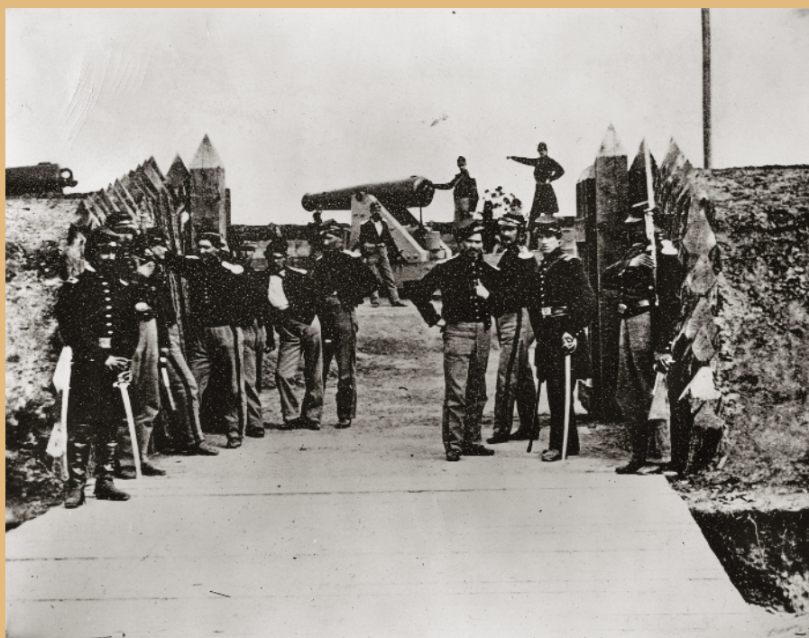
Sallyport at Fort Stevens; Defense of Washington, D.C.; 1864