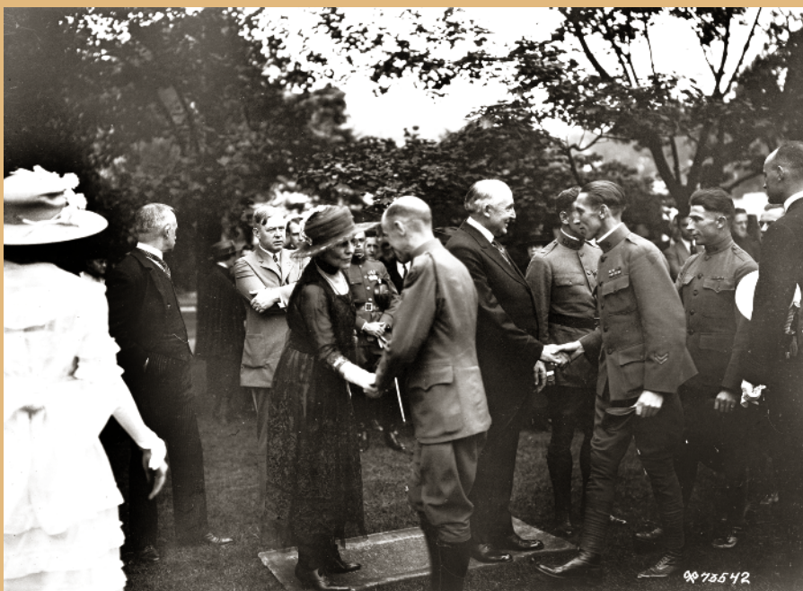
President and Mrs. Harding greeting soldier patients at the White House, 1922

Although not physically relocated, the Historical Division, Office of the Surgeon General, was transferred to the administrative jurisdiction of the Army Medical School on July 21, 1920, where the work of preparing the history of the Medical Department in the World War was continued. 62