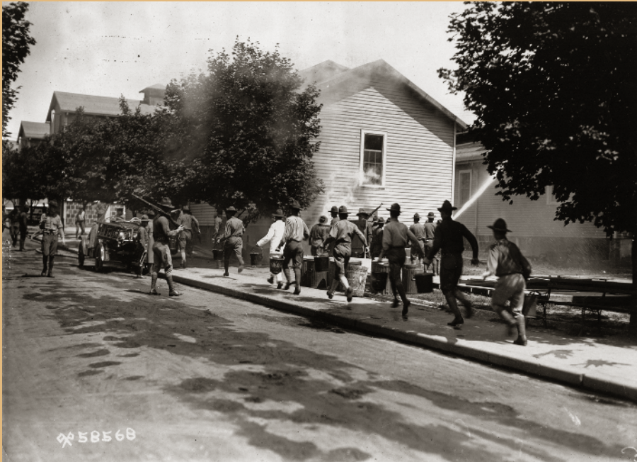
The Great Fire, December 1919

Although from fifty to seventy-five per cent of all patients were engaged in one or more types of occupational therapy, it was necessary to reduce the departmental staff by September. Some of the aides had been quartered in temporary frame and canvas buildings erected just across Georgia Avenue and above Geranium Street, where a low-cost housing development was built during World War II. After September 1921, such