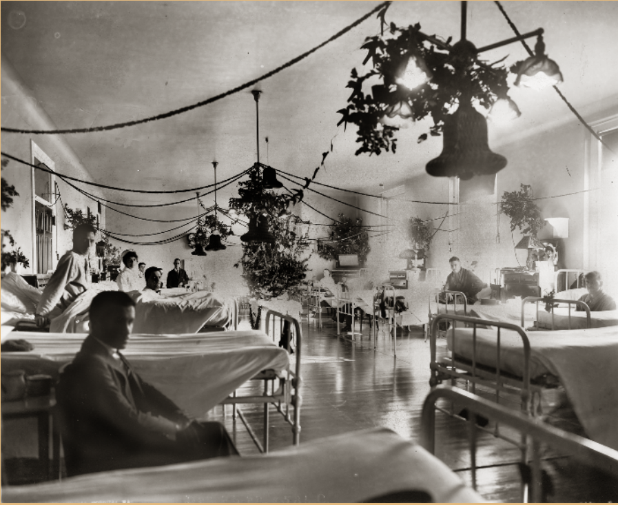
Christmas Cheer for Ward 9, 1922

with applied methods in the treatment of prophylaxis of disease. 63 As the training of enlisted technicians was expanded, thirty men were graduated in the basic course and ten others qualified as expert laboratory technicians. Forty-five X-ray technicians were trained, of whom twenty-two received certificates for special proficiency. 64