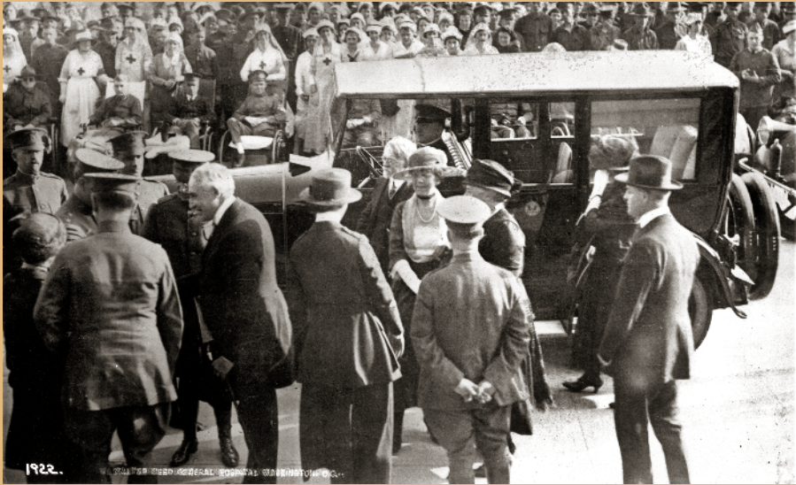
The Hardings Visit Walter Reed, 1922

continued its well established efforts to increase the number of specialists through a twelve-week course in X-ray. The schedule was divided into three four-week periods, with X-ray physics taught in the first period, the students receiving practical work in the roentgenology laboratories of the School and hospital. 59