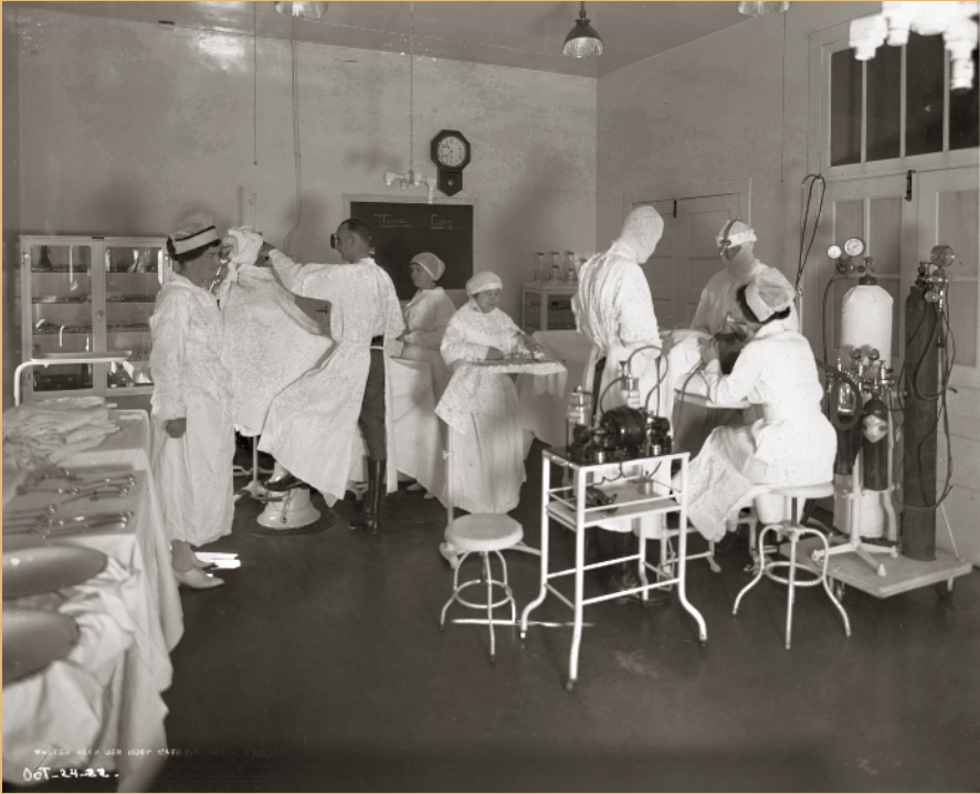
Operating Room; Eye, Ear, Nose and Throat Clinic, 1922

As the busy Surgical Service performed 2,439 operations during 1920, it is little wonder that the annual report carried a statement that “anesthesia is a developing field ... and there is much to be investigated especially as to nitrous oxygen; it is the aim of this department to add its effort to the progress of this rather neglected branch of surgery.” Two unnamed Army nurses and two civilian nurses from Providence Hospital, Washington, D.C., were trained in the use of gas oxygen anesthesia. Further, the Department of Anesthesia reported a detailed break-down on its cases: of the 1,305 general surgical cases exclusive of obstetrics, 649 received nitrous oxide; 123 nitrous oxide-oxygen-ether mixtures; 533 were nitrous oxide-ether sequences. Moreover, 797 local anesthetics were used in addition to the inhalation method. Of the 2,439 operations, the EENT Section led with 1,081; of the 1,358 remaining operations, 321 were in general surgery, with appendectomies and herniotomies leading the list.