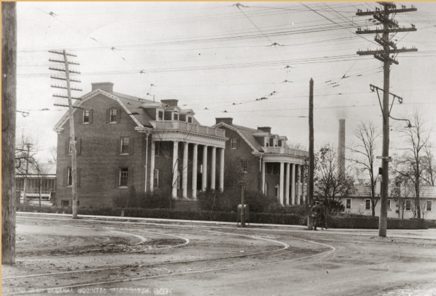
Officers Quarters from Butternut Street, 1919