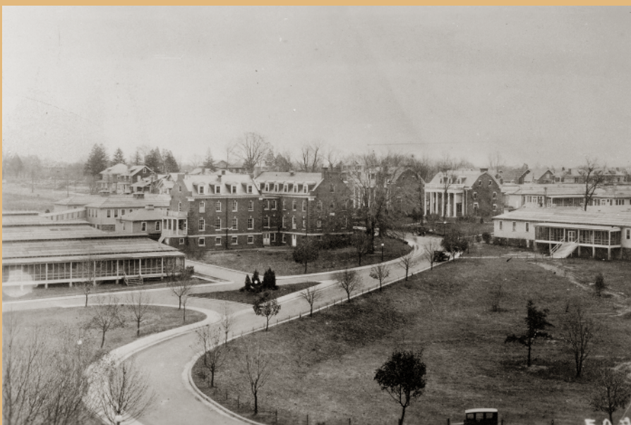
1919: Nurses Residence & Officers' Quarters looking toward Butternut Street.