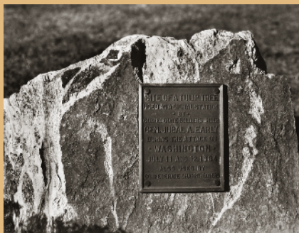
Tulip Tree (1919)

It is interesting in this connection, to note that 621 neuropsychiatric cases were