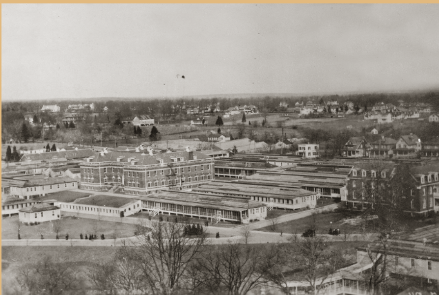
1919: View from Power House, showing civilians—around Greenhouse on Georgia Avenue.