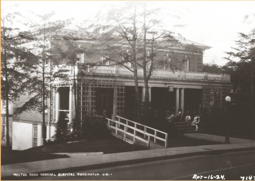
Service Club or Guest House

regularity he spent his thirty-day annual leave pursuing Colorado trout. It was not the fishing season, however, when quite unexpectedly the Chief of the Surgical Service announced that he wasn't feeling well, believed he was in need of a rest, and would be absent from Walter Reed for ten days or two weeks. He was noted for his rude good health; his staff was aghast at this break in his orderly routine. He had hardly departed for his "convalescence," however, when the Assistant Chief of the Surgical Service eased himself into the medical office to inquire if there were any cases for surgeons. 25