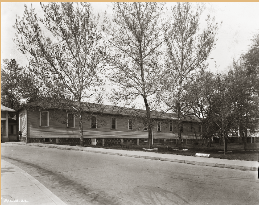
Library Exterior, 1922