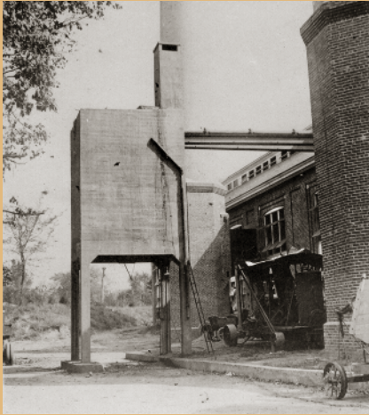
Powerhouse Steam Cider, 1922

Research work in the pneumococcus continued during 1922, with extensive studies made on the bacteriology of water; ointments for use in treating syphilis; streptococcus infections, dental caries, etc. As a record high, forty-four individuals were treated for hay fever. The Department of Roentgenology was, as usual, busy, and in addition to the routine work, the X-ray clinic sponsored a repair and maintenance section in order to maintain in good order the apparatus then in use at Walter Reed, Camp Meade, Maryland, and Fort Myer, Virginia. 71