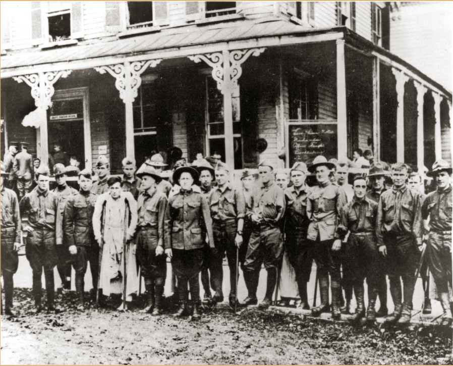
The Old Lay House; Walter Reed U.S. Army General Hospital, 1919

The Act of July 11, 1919 (41 Stat 122) provided $350,000 for the purchase of 26.9 acres of land for the final location of the Army Medical Museum and Library, a plan approved by the Bureau of the Budget and the President. Unless the Mall development was imminent, however, the President believed the Library project should be delayed because of a current fiscal deficit. The Director of the Budget countered with the proposal that Congress authorize the project in a special bill, with the actual monies appropriated at a later date. 5 Neither proposal resulted in action, and the principal handicap, which was to prevent indefinite development of the total plan on “Walter Reed Medical Center” now came into relief: the War Department was unwilling to support a costly technical service operation from its general appropriation, and the usual demands on the Medical Department budget prevented construction of the Library from its own current appropriation.