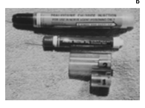
Fig. 5-5. The MARK I kit with its two autoinjectors: the AtroPen (containing atropine), labeled 1, and the ComboPen (containing 2-pyridine aldoxime methyl chloride, 2-PAM Cl), labeled 2. (a) The two unused injectors in the safety clip, and the black carrier. (b) The used injectors and empty safety clip.

Few data on the cardiovascular effects of nerve agents in humans exist. In mild-to-moderate intoxi-