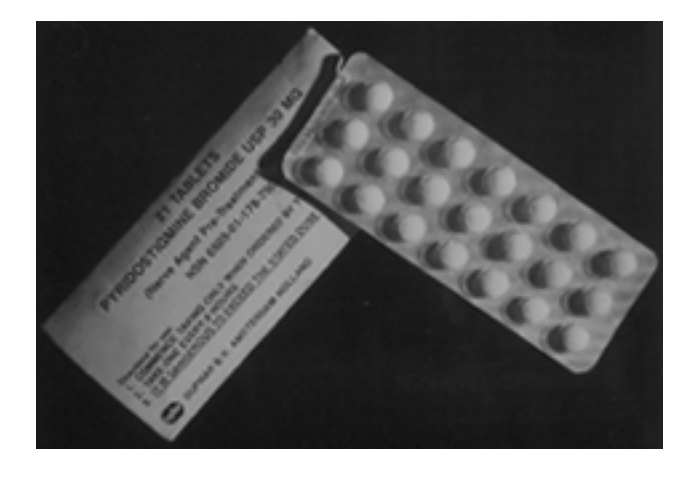
Fig. 6-1. A pyridostigmine blister pack containing 21 30-mg tablets, along with the carrying sleeve. This is the nerve agent pyridostigmine pretreatment set (NAPPS) that was used by designated military personnel during the Persian Gulf War.

stocks of U.S. combat units. The compound is packaged in a 21-tablet blister pack called the nerve agent pyridostigmine pretreatment set (NAPPS, Figure 6-1). One NAPPS packet provides a week of pyridostigmine pretreatment for one soldier.<sup>3</sup>