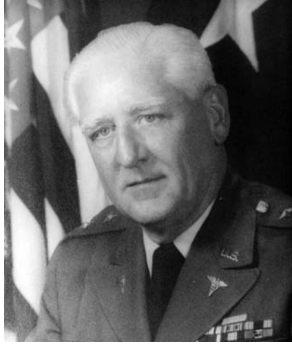
Major General Joseph L Bernier April 5, 1909–January 4, 1989.