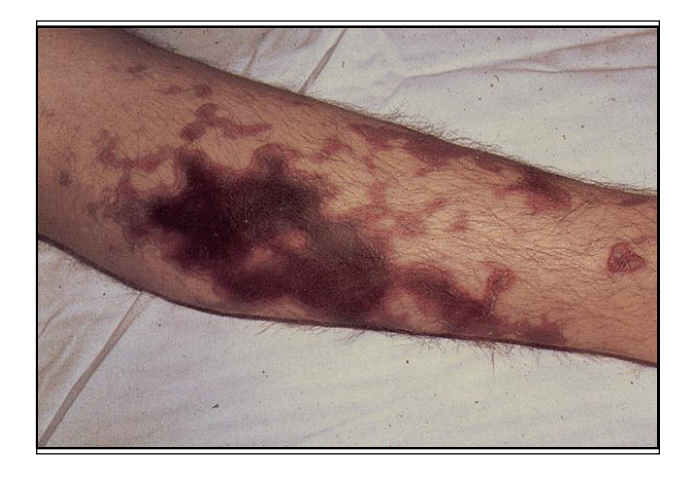
Fig. 13-12 . This patient, a young man with meningo-coccemia, developed a stiff neck and fever several days before these purpuric macules developed. These lesions progress by coalescence into angulated, confluent, reticulated patches with central necrosis.

Postmortem studies<sup>44</sup> have found varying degrees of myocarditis in over 50% of patients who die of meningococcal disease. There may be clinical evidence of heart failure, which cardiac glycosides have successfully reversed.