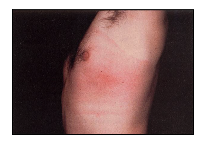
Fig. 13-14 . As the annular erythematous border of the eruption of erythema chronicum migrans advances away from the central bite site, very large lesions may develop.

rated or flat. The central portion partially clears, often leaving an erythematous central punctum, but may remain red and indurated or, rarely, become necrotic. These signs suggest a differential diagnosis of brown recluse spider bite, cellulitis, or tularemia (Figure 13-14).<sup>67</sup>