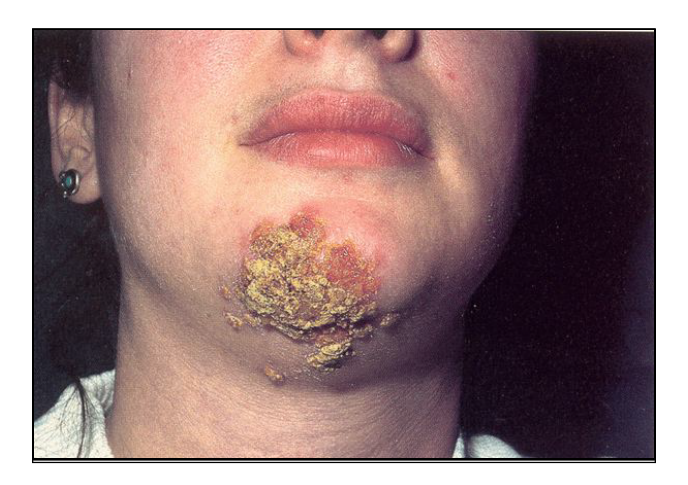
Fig. 13-1 . This thick yellow crust is typical of impetigo. Exudate from underlying denuded tissue dries, and patients present with this characteristic clinical sign.

The characteristic sign of impetigo is superficial, stuck-on–appearing, honey-colored crusts (Figure 13-1). This is dried exudate from the underlying