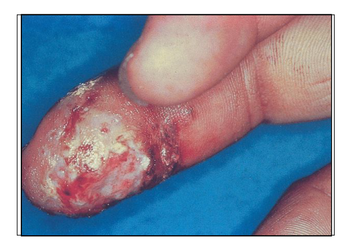
Fig. 13-8 . This ulceration on the hand is typical of tularemia in a rabbit hunter, one who skinned an infected rabbit and in so doing, infected his hand. He will subsequently develop distal nodes in his axilla that will likely suppurate. He will also develop profound malaise, chills, and fever. Cultures are typically negative, even if special media are used. Diagnosis is usually made on the basis of serologic testing.

Of rabbit-associated cases of tularemia, 80% to 90% of patients have axillary or epitrochlear adenopathy; of tick-borne cases, 60% to 70% have inguinal or femoral adenopathy. Glandular tularemia occurs in 5% to 15% of cases and is characterized by lymphadenopathy without skin ulceration. In the typhoidal form (approximately 5% of cases), fever, weight loss, and prostration occur without lymphadenopathy. The protean manifestations of tularemia, including oropharyngeal and oculoglandular forms, and the often-negative history make diagnosis difficult.<sup>33</sup>