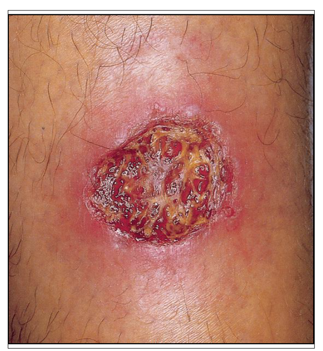
Fig. 13-4. This punched-out ulceration above the ankle is typical of the "jungle sores" seen in Vietnam and the South Pacific during World War II. It had been present for several weeks without change. A culture was positive for \beta -hemolytic streptococci, group A. This lesion of ecthyma rapidly responded to appropriate antibiotics.