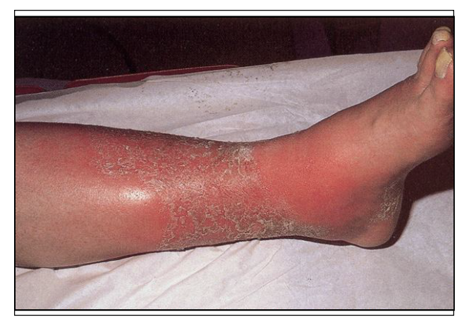
Fig. 13-6 . This erythematous lesion above the ankle has been slowly worsening for several days. It is hot to touch. No raised, palpable edge is noted. In severe cases, such as this one, scaling is often seen over the surface. This location is classic for cellulitis.