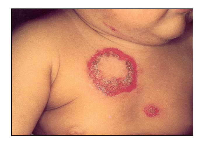
Fig. 13-2. In bullous impetigo, the vesicles and bullae quickly rupture and form a thin, dry, varnishlike veneer. Annular lesions are not uncommon. These were positive on culture for Staphylococcus aureus .

eroded tissue. While impetigo often occurs on the face, any break in the skin can become secondarily infected. In the field, exposed skin of the arms and legs will be involved frequently, as most insect bites, dermatophytoses, allergic contact dermatitides, and traumatic sores commonly become secondarily infected. Impetigo heals without scarring because it does not penetrate the epidermis.