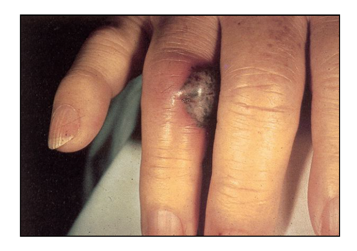
Fig. 13-10 . Hemorrhagic pustules on the digits are often indicative of septicemia with Candida albicans or Gramnegative organisms. In this patient, Corynebacterium diphtheriae was the cause.

cause of death in children was suffocation. Streptococcus pyogenes is a common cause of secondary infection, which is usually manifested by a bright red pharynx and fever above 103°F.<sup>4,40</sup>