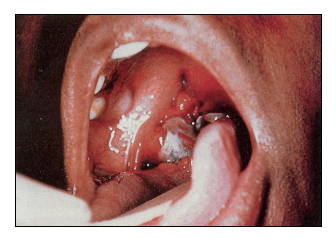
Fig. 13-9 . This febrile patient with pharyngeal diphtheria has erythema, edema, and a gray membrane on the tonsils and posterior pharynx.

The incubation period for C diphtheriae is usually 2 to 4 days. Pharyngitis is the most common presentation of diphtheria and is characterized by abrupt onset, fever (usually < 103°F), mild pharyngeal injection, pharyngeal pain, a uniquely fetid breath, and the development of a membrane. This membrane may be on one or both tonsils, but it may also extend to involve the posterior pharynx, soft palate, larynx, and nasopharynx, which indicates more severe disease (Figure 13-9). Initially white, the membrane evolves into a dirty gray color with patches of necrosis. Cervical adenopathy and swelling may cause the patient to have a "bull-neck" appearance, with respiratory stridor. Involvement of the larynx, trachea, and bronchi may produce airway obstruction. This may require intubation and mechanical removal of the membrane, or the patient may rapidly become exhausted and die. Indeed, in the late 19th century, the most common