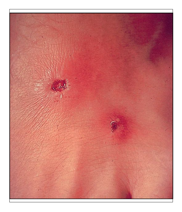
Fig. 13-11 . Diphtherial ulcerations characteristically have a purplish rolled border and involve the feet or legs.

have permanent conduction defects. The serum aspartate aminotransferase level closely parallels the intensity of the myocarditis and may be used to follow its course.<sup>4</sup>