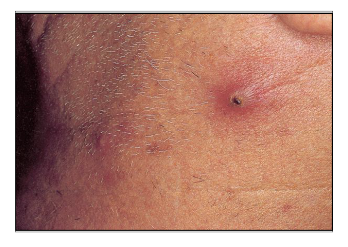
Fig. 13-5 . This erythematous papule with a pustular center is centered about a hair follicle. A furuncle is best treated with local heat and drainage.