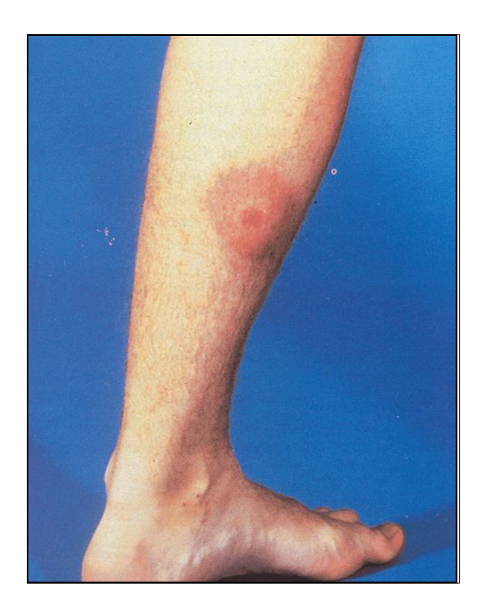
Fig. 13-13. This early lesion of erythema chronicum migrans developed 2 weeks after a tick bite to the patient's leg. The site of the tick's attachment is clearly seen in the center of the peripheral erythema.

Stage 1 begins 3 to 30 days after the tick bite, which only about one third of patients recall. This stage is characterized by nonspecific constitutional symptoms: fever, chills, malaise, fatigue, arthralgias, and headache. The most prominent manifestation is ECM, which is present in 60% to 83% of adults, <sup>67</sup> but in fewer than 25% of children. <sup>58</sup> ECM typically begins at the site of the tick bite as an erythematous papule that enlarges to an annular configuration (Figure 13-13). The edge may be raised and indu-