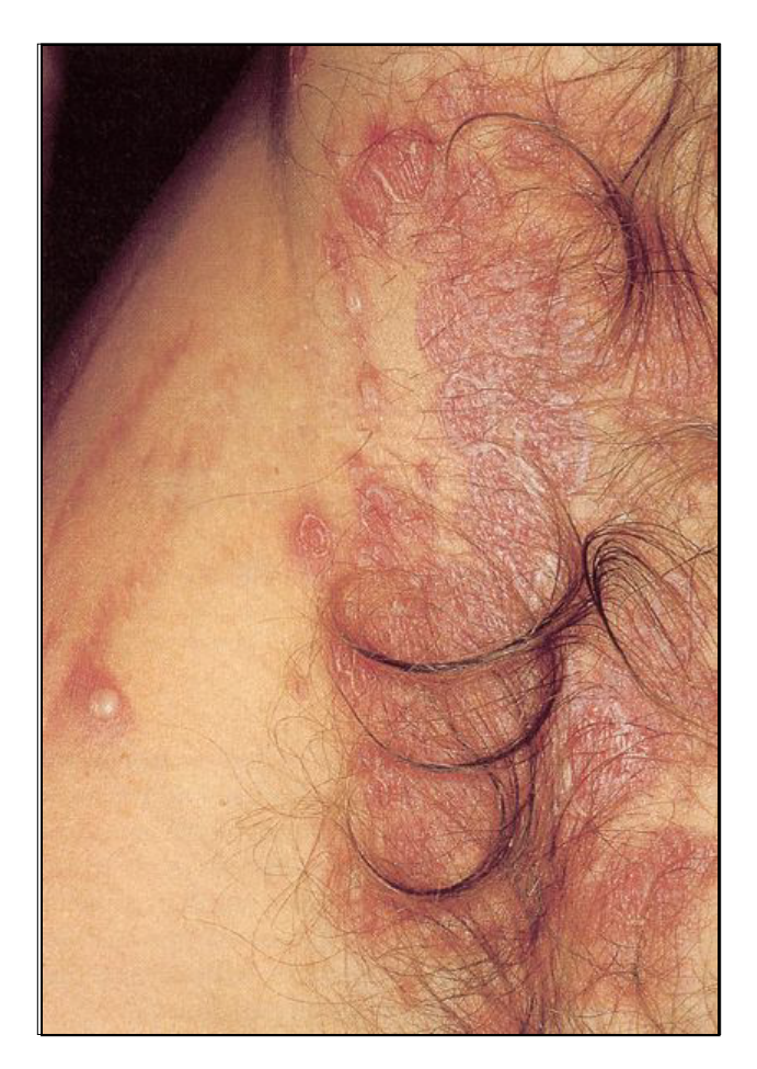
Fig. 13-3. A superficial pustule is noted anterior to the axilla. A Gram's stain of the contents revealed neutrophils and Gram-positive cocci in clusters. Culture was positive for Staphylococcus aureus . In the axillary vault, the pustules have ruptured, leaving collarettes of scale, which are characteristic of bullous impetigo.