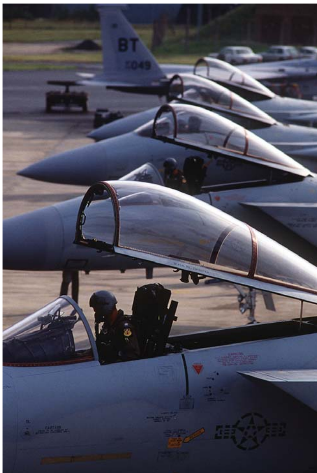
Fig. 19-1. A pilot awaits clearance for takeoff. Test pilots who evaluate new or recently repaired equipment are not considered research subjects.

sician decides to try these same drugs on a series of patients to see if the results are the same as they were with the original patient, then this activity would most likely be classified as research. Similarly, a noncommissioned officer (NCO) demonstrating how to make anthropometric measurements for the unit weight management program is engaged in teaching rather than research as long as the activities are confined to a particular class or classes. If the NCO were to make anthropometric measures of service members in several units and compare them to see which unit had the greatest physical fitness, then that would be research.