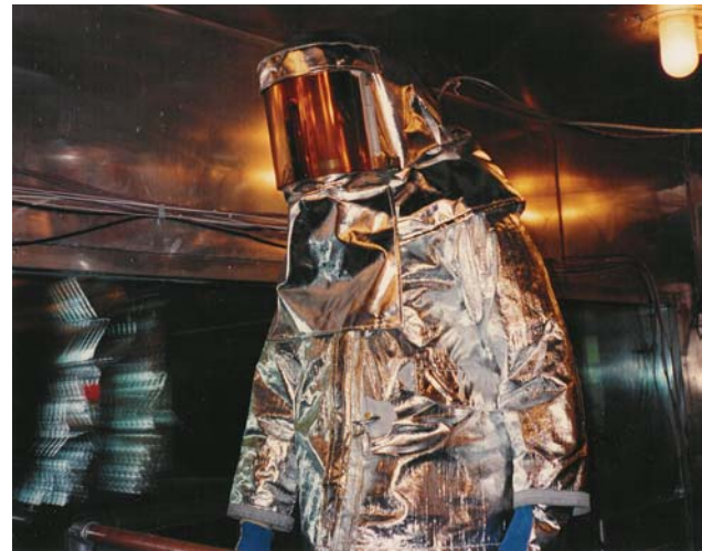
Fig. 19-5. The climate chambers are an important resource in the development of clothing or protective equipment. This 1990 photo shows a firefighting suit developed by the Navy. Although the soldier who is volunteering to test this suit for the US Navy may not derive any direct benefit from his participation in research, this work will benefit thousands of other soldiers, and is thus permissible under the principle of justice .

Some research is conducted in military hospitals where sick soldiers may receive direct benefit by participating in research designed to test what may be an improved treatment for their illness. Other military research involves testing healthy research volunteers who receive no direct benefit from the research (Figure 19-5). Should the military be involved in this type of research? Yes, according to the principle of justice as defined in the Belmont Report . The burden for the research should be born by the people benefiting from the research. Most research being conducted by the military is directly applicable to the military's unique mission and will thus benefit soldiers everywhere, even though the individual soldiers involved in the research may not