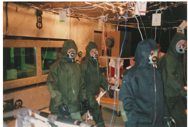
Fig. 19-8. These soldiers are participating in a November 1990 study to determine physiologic response to the personal protective ensemble. Modern warfare carries the increasing likelihood that enemies will employ biological or chemical agents such as anthrax or nerve gas. Researchers are continually developing garments and equipment that will protect soldiers from these modern threats, although they must be tested to ensure that they do not hinder the soldier’s mission by limiting dexterity or by placing the wearer at risk of heat exhaustion. The timely development of such garments has the potential to protect soldiers from hostile threats on the battlefield, but researchers face an ethical imperative to ensure the safety of the soldiers who assist in the development of such protective equipment.

It is appropriate to ask soldiers who do not sign up for any studies over a period of several months what their intentions are. If they are no longer interested in participating in research they can then be reassigned to another installation if necessary. Soldiers who no longer wish to participate in research typically ask to be reassigned. Sending a sol-