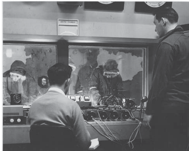
Fig 19-3. Constructed in the mid-1950s, and completely renovated in the late 1990s, the climatic chambers in Natick, Massachusetts, can simulate weather conditions as cold as -70^{\circ}\text{F} , with variable relative humidity and precipitation. This arctic chamber and the companion tropic chamber are used to test clothing, equipment, and human physiology under a variety of environmental conditions. Investigators shown here are observing human volunteers in a circa 1958 study in the cold.

Between 1954 and 1955 a climatic chambers building was constructed in Natick, Massachusetts specifically to conduct climatic research using human volunteers (Figure 19-3). Here soldiers and their equipment could be tested while replicating virtually any climatic condition on earth. In the