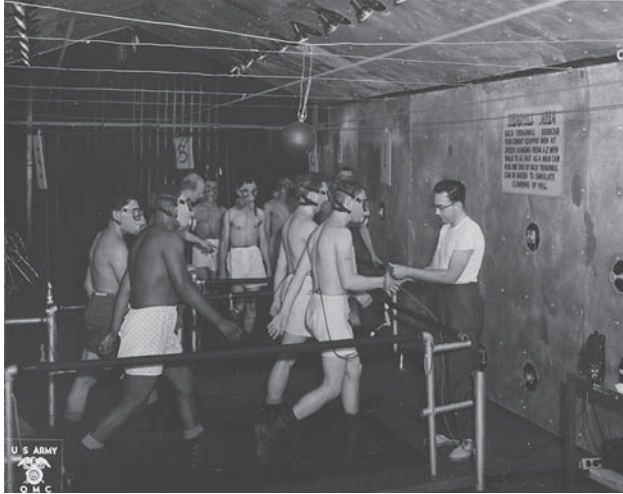
Fig. 19-4. Investigators in a 1958 study at the Natick Labs attempt to determine how much heat stress is caused by requiring soldiers to wear a protective mask. From its inception, the research program at Natick sought to adhere to ethical guidelines by obtaining informed consent from its volunteer subjects.

the benefits of the research are shared by the same population. Under the principle of justice, for example, soldier-volunteer testing of the moisture vapor transfer properties of newly designed chemical protective uniforms in the heat is considered appropriate. There are numerous environmental and battlefield conditions that soldiers will be subjected to whereas these conditions rarely apply to civilian workers.