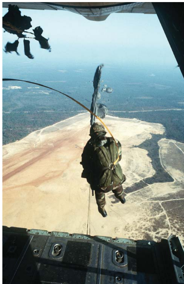
Fig. 19-2. A parachutist exits a plane. Airborne soldiers who were recruited to participate in a randomized controlled trial of an outside-the-boot ankle brace, in hopes that this new equipment may reduce ankle injuries among parachutists, were briefed thoroughly on the purposes of the study by the investigators, who obtained their informed consent.

Research is governed by rules. There are, however, two fundamental problems with rules. First, although they may represent society’s collective wisdom at the present time, it is unrealistic to ex-