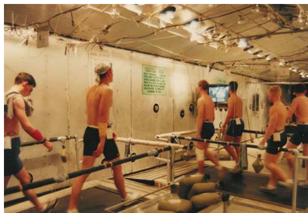
Fig. 19-6. These soldiers are participating in a March 1990 study to determine whether dietary sodium intake is related to acclimatization to extreme desert conditions (120°F and 20% relative humidity). The overhead rigging shown in the photo includes lines for wires and tubes used to collect data on physiologic status. Physicians monitor volunteer participants in such studies for adverse reactions—an important step in assuring their health and well-being.

When the investigators are conducting the briefing, a human research program team member is always present as a witness to ensure that the investigator thoroughly explains the study in terms the soldiers can understand. If there is something that might confuse soldiers the witness asks questions to get clarification. Once soldiers see the witness asking questions or other soldiers asking questions