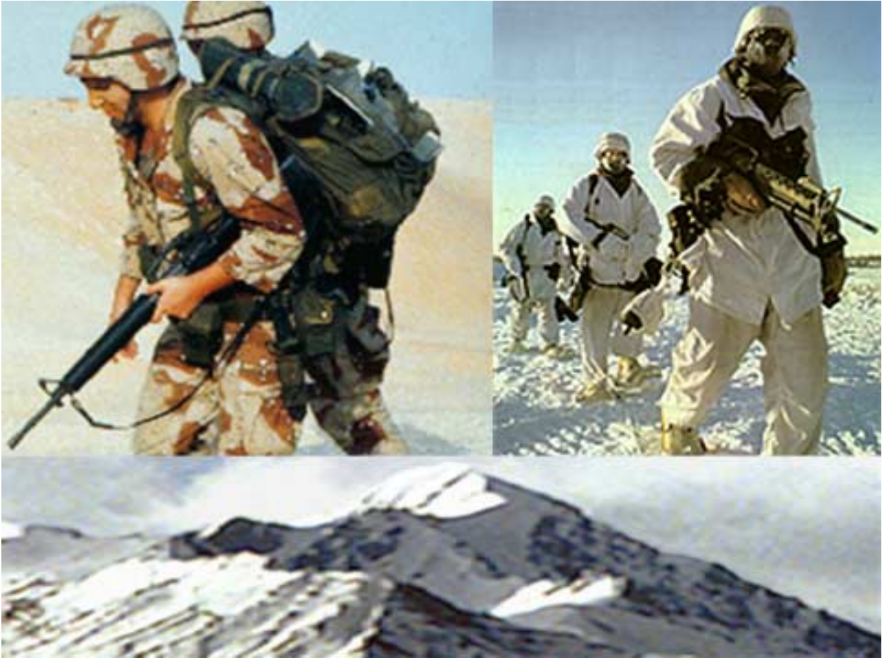
The environments that face combatants on modern battlefields.

Art: Courtesy of US Army Research Institute of Environmental Medicine, Natick, Massachusetts