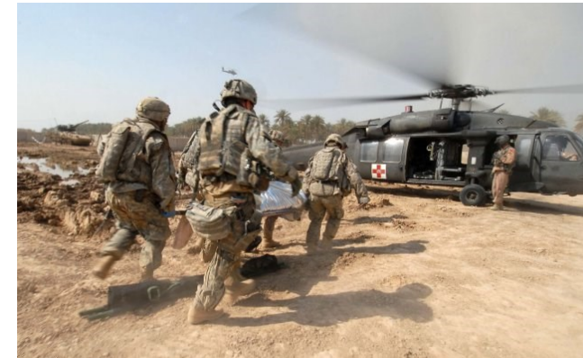
9th Infantry Regiment, 4th Stryker Brigade Combat Team