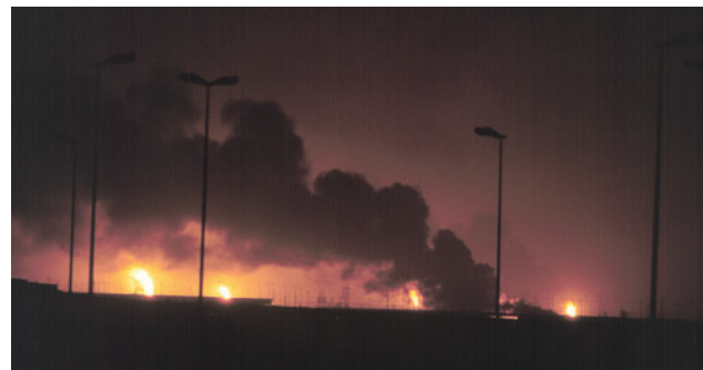
Figure 6-1. Burning oil wells seen at night from Camp Freedom, Kuwait, May 1991.

After the Persian Gulf War, over 200,000 veterans claimed they had developed Gulf War illness (GWI), an illness that correlated with their exposures, while deployed. 14 The medical community struggled to identify a medical explanation for the variable and nonspecific constellation of symptoms, sometimes referred to as “mystery illness” and more popularly “Gulf War Syndrome,” experienced by these veterans.