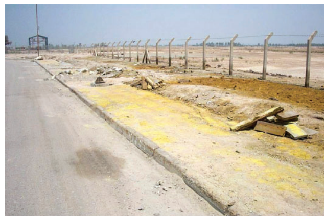
Figure 6-8. Yellow sodium dichromate, a source of hexavalent chromium, on the ground after bags of the chemical were opened at the Qarmat Ali Water Treatment Plant, Iraq, April–September 2003.

Cr VI can cause acute and long-term health effects, including lung cancer if inhaled at high enough