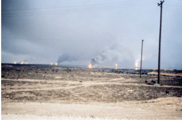
Figure 6-2. Formation of a composite “super plume” over the Ahmadi Oil Fields, Kuwait, May 1991.