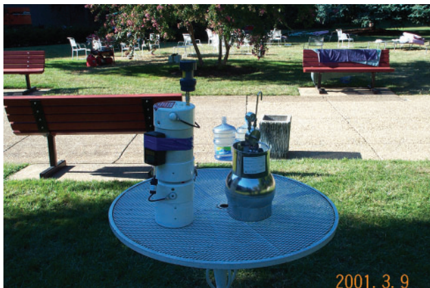
Figure 6-7. Environmental sampling conducted in the courtyard at the Pentagon after September 11, 2001.

A total of 3,273 precleanup samples, including those tested by direct reading instruments, were collected at the Pentagon. An additional 443 postcleanup