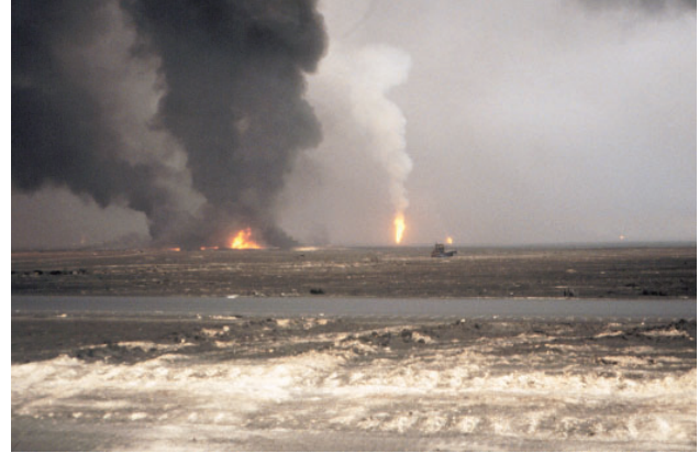
Figure 6-3. Burning oil wells emitting different-colored smoke, indicating different combustion products, Ahmadi Oil Fields, Kuwait, May 1991.

The symptoms included some combination of chronic headache, chronic shortness of breath and breathing difficulties, widespread pain, memory and concentration problems, persistent fatigue, gastrointestinal problems, skin abnormalities, and mood disturbances. Most of the symptoms did not fit the diagnostic criteria for established medical or psychiatric conditions. 6,15 The Persian Gulf War was unusual in that returning veterans reported these kinds of symptoms in much larger numbers than were reported in previous wars. 16–19