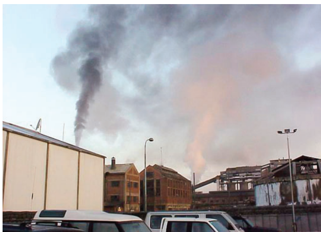
Figure 6-5. Emissions from coal-fired power plants impacted air quality where US forces were located, Bosnia, 1999.

Environmental surveillance for Operation Joint Endeavor, Joint Guard, and Joint Forge (Operation Joint Endeavor transitioned to Operation Joint Guard on December 20, 1996; Operation Joint Guard transitioned to Operation Joint Forge on June 20, 1998) was the most comprehensive surveillance effort for any deployed US force to date. It involved a coordinated approach between military tactical and support orga-