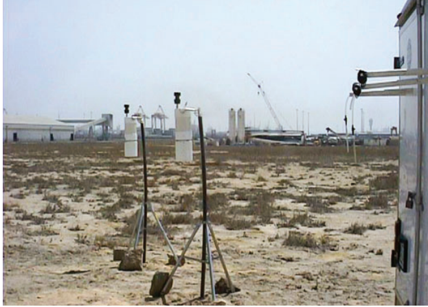
Figure 6-10. Air sampling for particulate matter at Ash Shuaiba Port, Kuwait, August 1999.