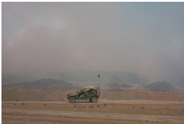
Figure 6-11. US forces patrolling the perimeter of the Mishraq sulfur mine fire, Iraq, July 2003.

The sulfur-fire plume extended 25 km to the south and was thought to be the cause of widespread reports of odors and mucous membrane irritation. SO 2 and H 2 S were detected near Qayyarah Airfield West, where the 101st Airborne Division was located. The smoke plume also reached Mosul, approximately 50 km to the north, as seen on satellite imagery. Approximately 3,000 personnel from the 101st were within a 50-km radius of the fire. Field environmental air sampling data collected by an Army preventive medicine detachment confirmed that SO 2 concentrations were very high and above safe levels. The concentrations of SO 2 measured in the air were expected to cause health effects that ranged from mild to moderate irritation, coughing, and choking. It is likely that exposure levels varied by distance from the mine, time exposed, and activities performed during exposure. However, it was not possible to determine an individual's actual dose of exposure because no sampling data were available, and individual location and activities were not recorded. 102