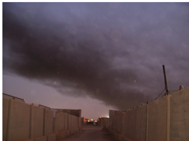
Figure 6-12. Emissions from an open burn pit drifting toward the life support area, Balad Air Base, Iraq, August 2006.

Concern mounted, and in August 2009, President Obama declared that “burn pits will not become another Agent Orange.” 121 VA Secretary Eric Shinseki asked, “How do we change what has been the 40-year journey of Agent Orange, the 20-year journey of Gulf War Illness, and prevent a similar journey for burn pit smoke?” 121 Lawsuits were filed in over 40 states in which former and current service members alleged they were exposed to air pollutants that caused health problems as a result of a contractor’s negligent management of burn pit operations. 120 Service members who had deployed to Afghanistan and Iraq