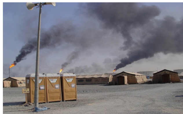
Figure 6-9. Flares and smoke from petrochemical plants near the life support area, Ash Shuaiba Port, Kuwait.

In support of the Persian Gulf War, Operation Vigilant Warrior (October 8 to December 15, 1994), and OIF, US forces utilized a portion of the Shuaiba Port Industrial Area in Kuwait as a sea port of debarkation/embarkation (SPOD/E). The SPOD/E provided a portal to transport heavy equipment in and out of the theater of operations. The Shuaiba Port Industrial Area contained petroleum refineries, a cement plant, a fertilizer plant, a chlorine plant, and other petrochemical industries (Figure 6-9). Beginning in March 2002, a mobile ambient air monitoring station monitored five of the six EPA criteria pollutants at the SPOD/E. The pollutants monitored comprised particulate matter less than 10 \mu\text{m} in diameter, carbon monoxide (CO), sulfur dioxide (SO 2 ), nitrogen oxides (NOX), and ozone (O 3 ). From January 2003 through approximately July 2005, a life support area, known as Camp Spearhead, provided living accommodations for US service members supporting the mission of the SPOD/E (Figure 6-10). The life support area closed in summer 2005, after which service members primarily working at the SPOD/E were housed at other sites, such as Camp Arifjan and the Kuwait Naval Base, largely due to the concerns identified by environmental monitoring.